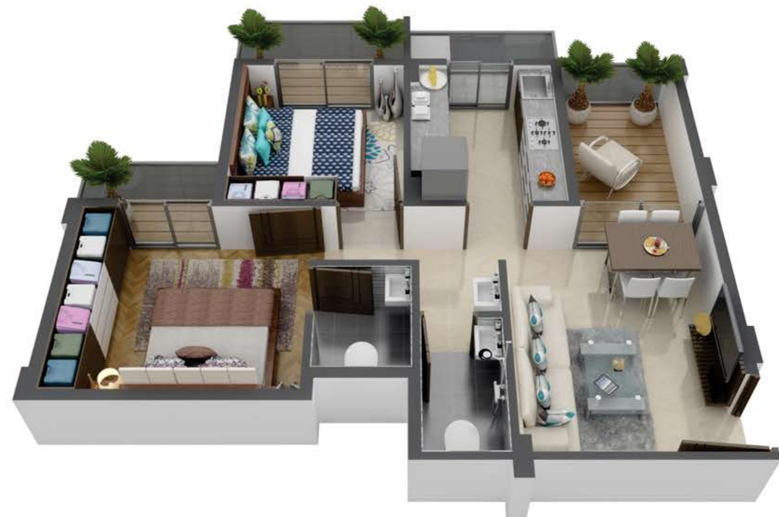
Unit Plan - 2 BHK