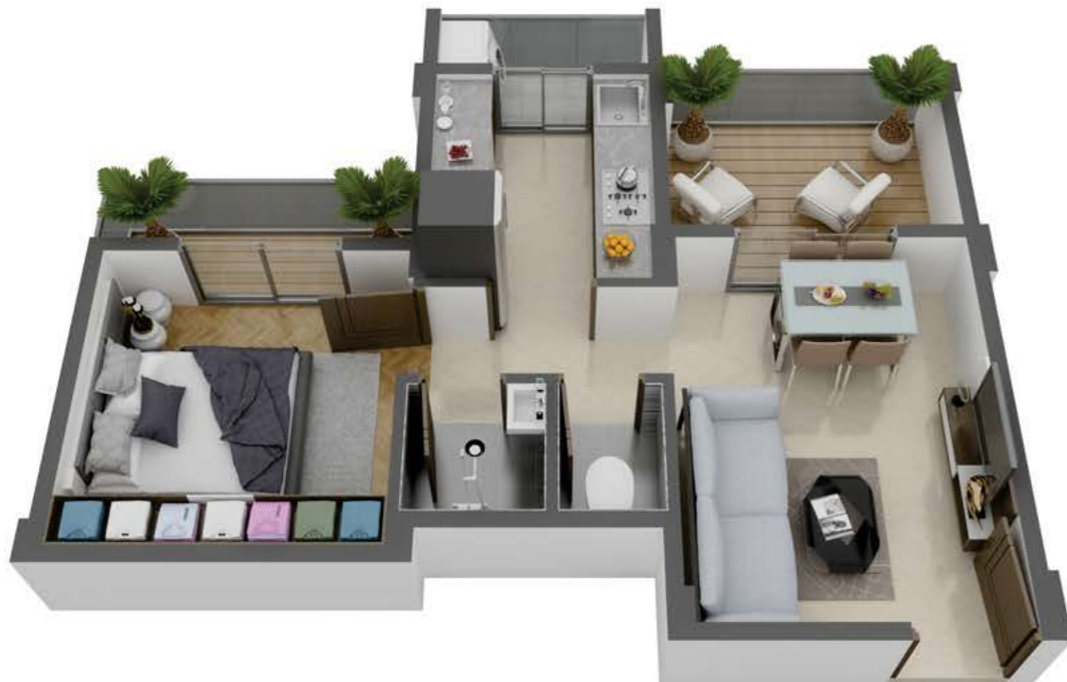
Unit Plan - 1 BHK